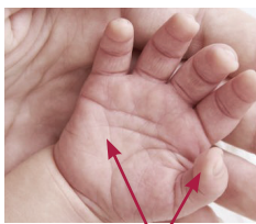
RH Application Sites