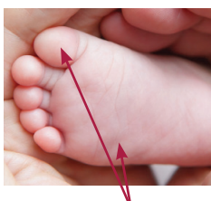
Foot Application Sites