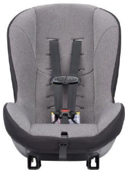
Evenflo Sonus Convertible