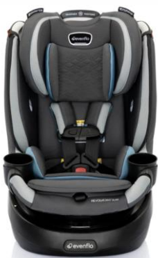
Evenflo Revolve360 Slim 2-in-1 Rotational Convertible