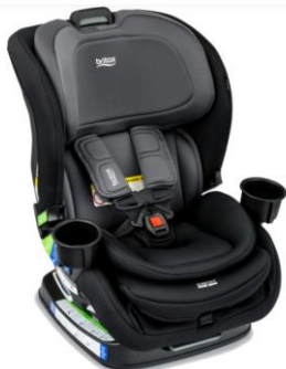
Britax Poplar ClickTight Convertible